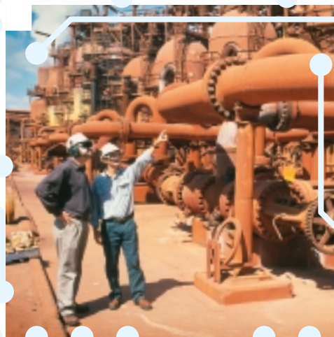
« CITEC secured a major contract with Queensland Alumina Limited of Gladstone for the provision of a full suite of ICT management and support services